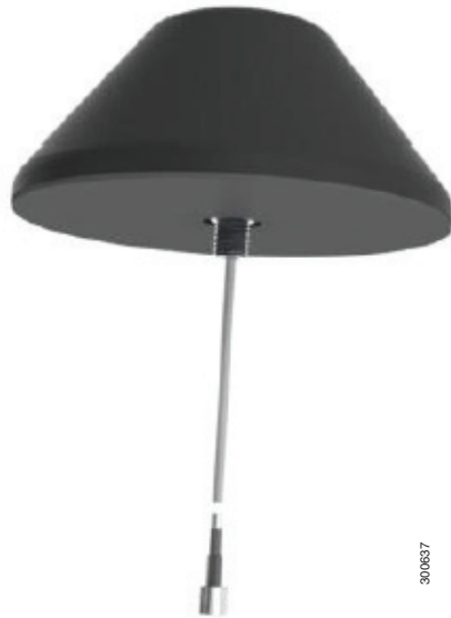
Figure 10-1 Low-Profile Saucer Antenna