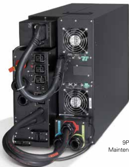
9PX 11kVA with Maintenance Bypass.