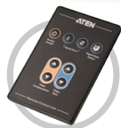
IR Remote Control Included