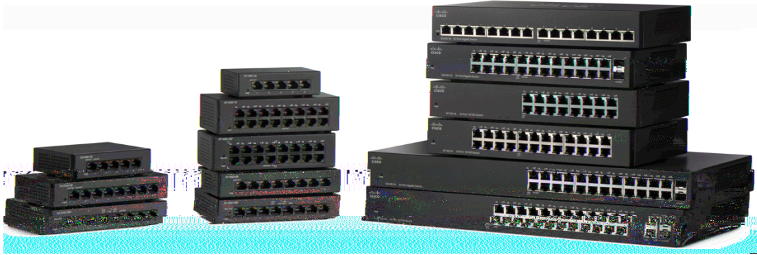
Figure 1. Cisco 110 Series Unmanaged Switches