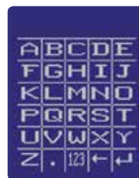
Alpha Numeric Keypad (For Strong Passwords)