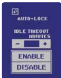
Auto-Lock Feature (Automatically times out the device when idle)