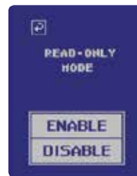
Read-Only Feature (Restricts users from overwriting or altering contents of the drive)