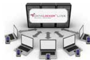
Compatible with DL Configurator to manage multiple devices