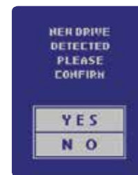
No Software or Drivers Mac, Linux and Windows Compatible