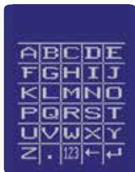
Alpha Numeric Keypad (For Strong Passwords)