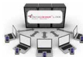
Compatible with DL Configurator to manage multiple devices