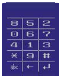
Rotating Keypad (To Prevent Surface Analysis)