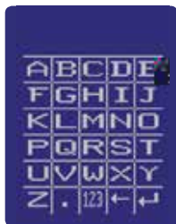
Alpha Numeric Keypad (For Strong Passwords)