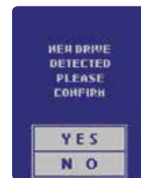
No Software or Drivers Mac, Linux and Windows Compatible