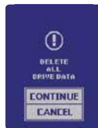
Rapid Secure Wipe Self-Destruct Mode (Optional)