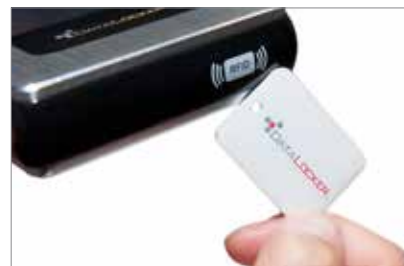
Unlock with RFID token (optional RFID 2 factor authentication)

Speed. Storage. And the ultimate in data security - all in the palm of your hands.