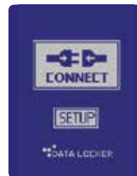
USB 3.0 Interface (USB 2.0 Compatible) No External Power Required