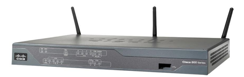
Figure 1. Cisco 881 Integrated Services Router with Integrated 802.11n Access Point

Tables 1 and 2 list the routers that currently make up the Cisco 880 data, voice, and SRST series, respectively.