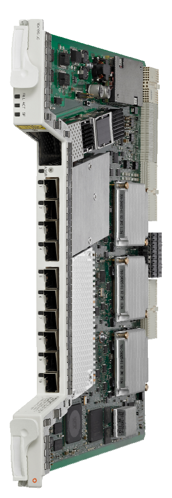
Figure 1. Cisco ONS 15454 10-Port 10 Gbps Line Card

Release 9.6 of the Cisco ONS 15454 MSTP extends the total data transport capacity by a factor of three, allowing Dense Wavelength-Division Multiplexing (DWDM) transmission of up to 9.6 Tbps (96 wavelengths at 100 Gbps each) in the C-band.