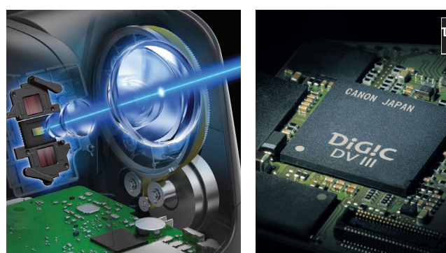
Genuine Canon Lens and High-sensitivity Sensor DIGIC DV III Image Processor (image shown of VB-M50B)

The lenses used in Canon Network Cameras share a similar design process as Canon's world famous EF lenses. In addition, Canon uses its expertise to create lenses that have many desirable qualities.