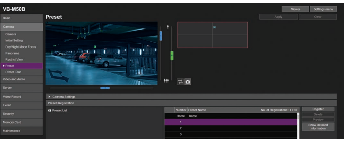
Preset setting screen for VB-M50B

Allow automation of camera movement to different areas of interest at different times of the day in order to save time and cover more important areas with a single camera. Canon Network Cameras internally save the desired Pan/Tilt/Zoom position of the camera making it easy to return without having to manually adjust each time. Presets may also include image settings such as Focus Mode, Exposure, Slow Shutter, White Balance, Day/Night and other settings that allow greater flexibility in adapting to varying light conditions.